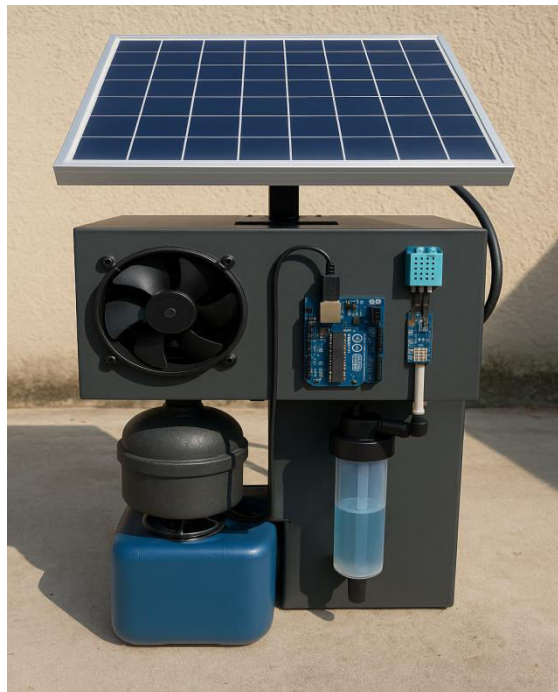
Figure 3: Proposed System Structure

The system leveraged cooling-condensation technology enhanced with Arduino-based intelligent control and sensor automation, enabling dynamic adjustment of the compressor operation based on real-time temperature and humidity data. This smart regulation allowed for precise dew point targeting, thereby optimizing energy usage while maintaining high water output. The integrated UV filtration unit further ensured drinking water safety, achieving Total Dissolved Solids (TDS) levels below 100 ppm.